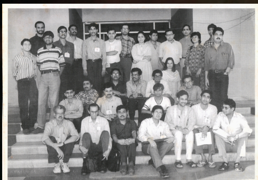
Group photo of first YATI conference in 1999 (Taken from the Proceedings of 1st YATI)

UG/PG students who are not currently involved in research but have a keen interest in astronomy and astrophysics are especially encouraged to attend the conference.