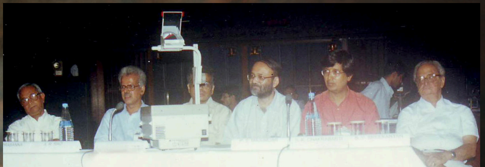
Panel discussion during the 2nd YATI conference in 2001 on "Do Blackholes exist?"